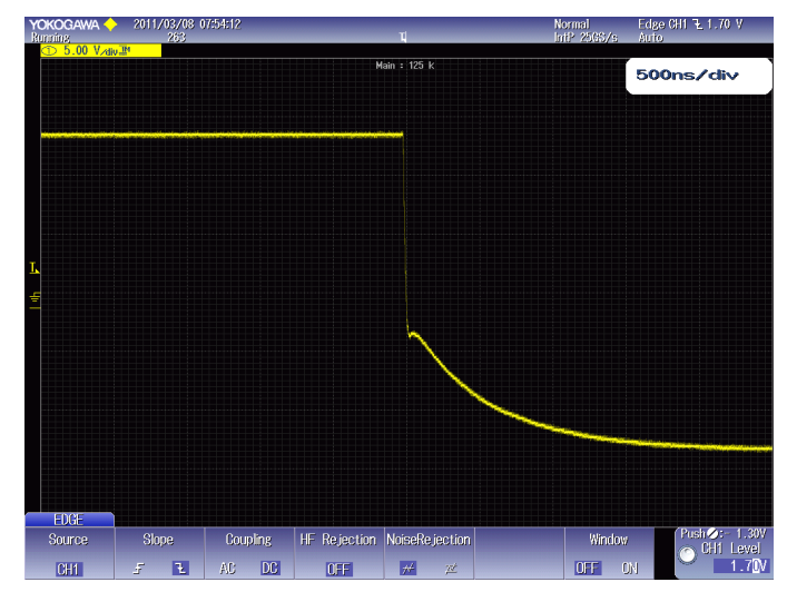
Gate driver edges can be as fast as desired